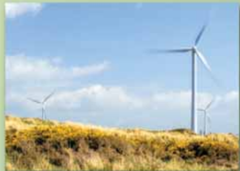
A new manufacturing plant for large-scale wind turbine blades is opening in 2008, creating many new jobs.