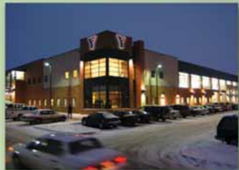
The city is brimming with new recreational opportunities like the new family YMCA and the spectacular Aberdeen Aquatic Center.