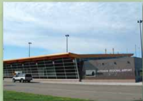
The new $6.6 million airport facility provides convenient commercial air travel across the country.