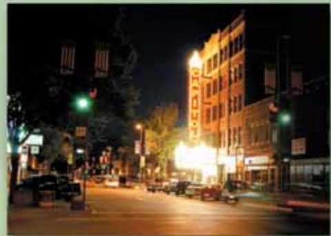
Aberdeen is seeing major growth in downtown and other commercial areas.

Grow! is an initiative of Absolutely! Aberdeen, a public/private partnership of investors and community leaders.