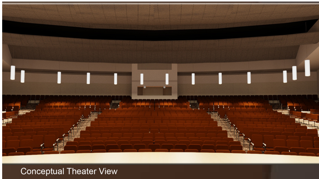
Conceptual Theater View