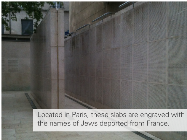
Located in Paris, these slabs are engraved with the names of Jews deported from France.

To learn more about Newman's journey, visit his blog: http://heinzproject.blogspot.com/