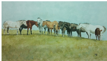
"Mares & Foals"